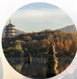
· West Lake Scenic Area