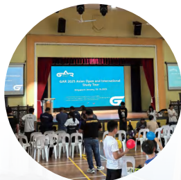
· Global Artificial Intelligence Robot Contest